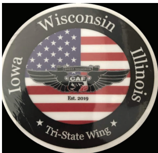
AirPower History Tour hosted by Tri-State CAF Wing. USS Illinois Base helps sponsor this event.